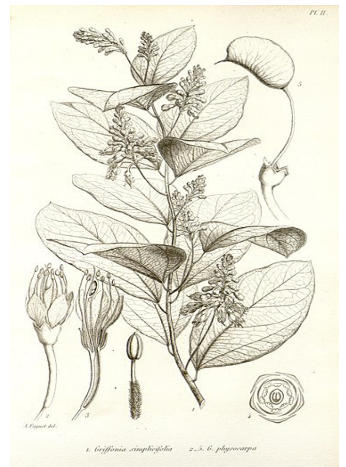
Adansonia, vol. 6: t. 2, A. Faguet