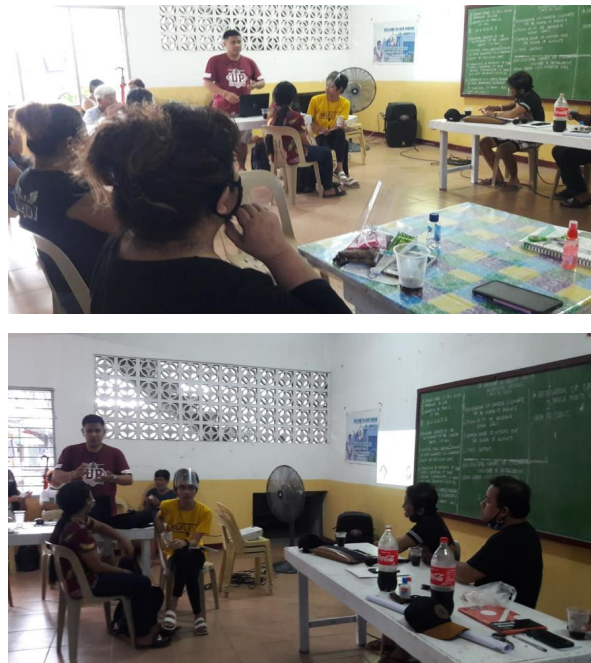
Figure 2: shows the focus group discussion during the Parish Pastoral Council Meeting