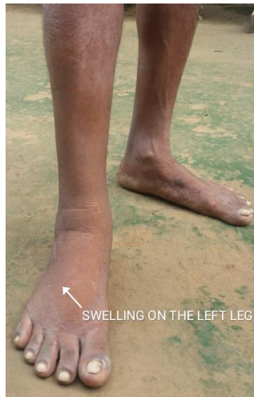
Figure 2: Lymphatic filariasis case with swelling of left leg.

in the prevention of LF contraction. Further extensive and regular surveillance of LF as well as experimental studies are needed to define the basic understanding of the disease among people of this part of the globe, for safer health with protective hygiene and required sanitation; this could limit the LF transmission.