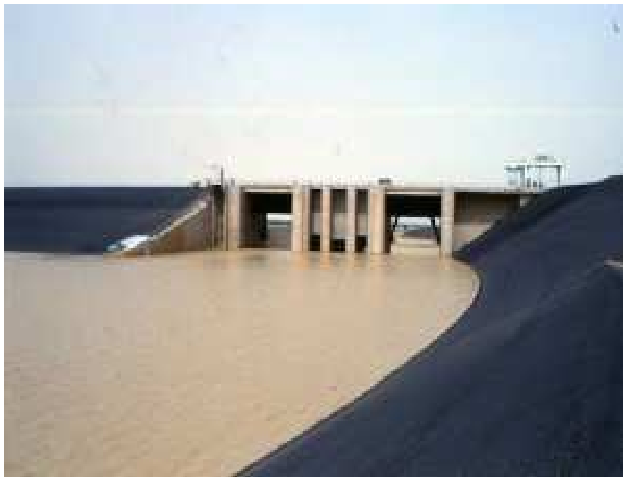
Figure 3: Goronyo Reservoir