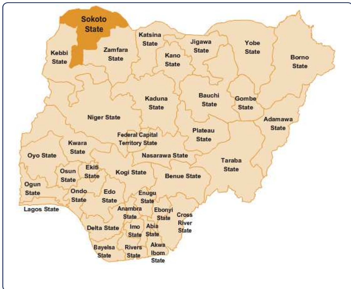
Figure 1: Map of Nigeria Showing Sokoto State

The fishermen's fish catches were measured based on species. The length of the individual fish specimen was measured using a meter rule to the nearest mm expressed as total and standard lengths as described by Bagenal and Tesch (1978) and the same method carried out by Gray et al. (2005), Balogun (2005) and Shinkafi et al. (2013).