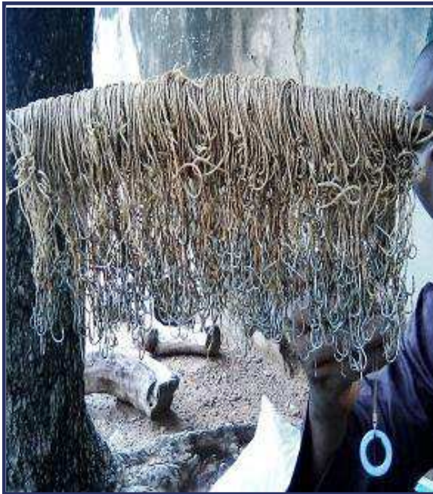
Hook and line no. 11